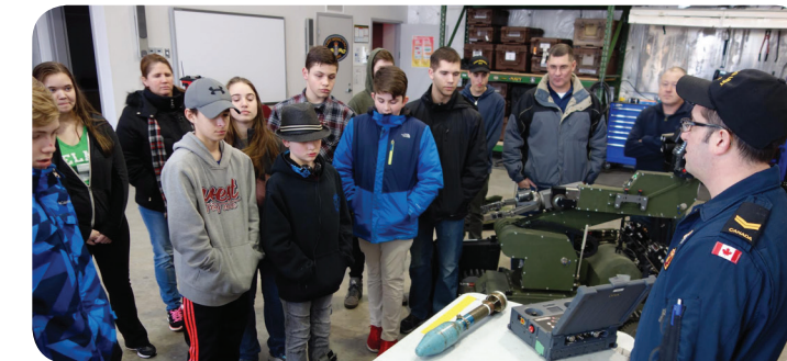
Top Left: Cadets from RCSCC Invincible, Orion Squadron, and Blue Angels Squadron on the steps of the British Columbia Legislature, Victoria, B.C. Bottom Right: Cadets on a tour of the Royal Canadian Navy Bomb Disposal Unit at Canadian Forces Base Esquimalt.

Our visit to Canada was incredible. We visited the Legislative Building and saw stained glass that rivaled anything I had seen before. I got behind the helm of a ship simulator (that I promptly crashed into some rocks), we got the inside scoop on decompression chambers and explosives at the base, and we learned the treasured history behind the First Nations at the British Columbia Museum. Near the conclusion of the trip, we came to realize that British Columbia had been an adventure that everyone would be describing for years to follow.