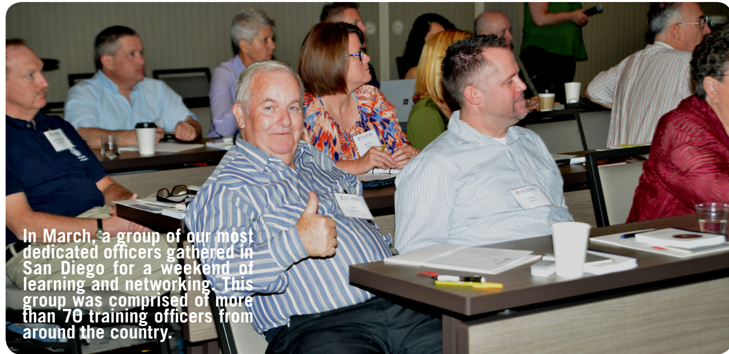
In March, a group of our most dedicated officers gathered in San Diego for a weekend of learning and networking. This group was comprised of more than 70 training officers from around the country.