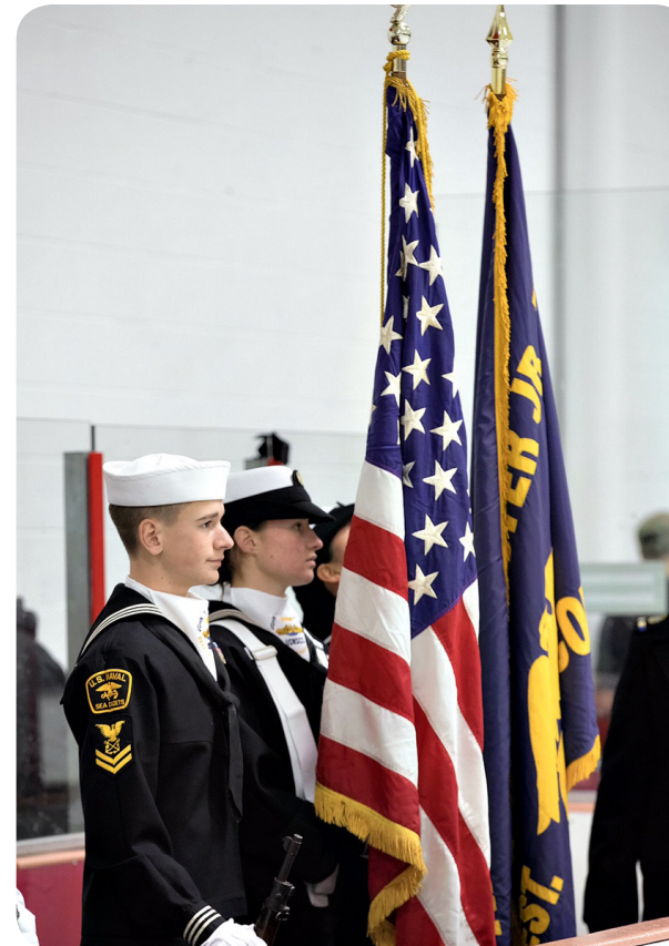
Photos of John T. Dempster, Jr. Division

Whatever you do in life, try to do it as well as these cadets perform their color guard duties.