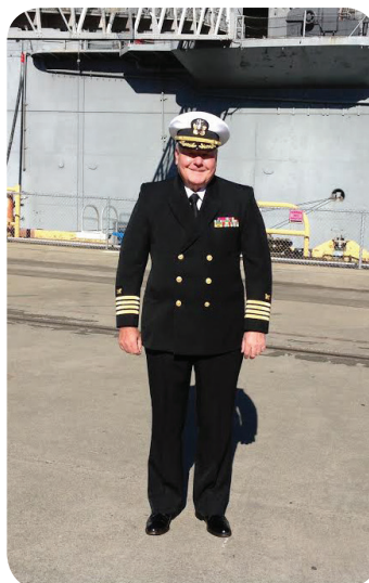
Left: USS Hornet pierside.