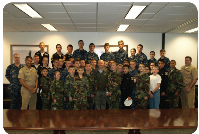
Right: The congressman was very impressed with the cadets' levels of respect, knowledge and engagement.