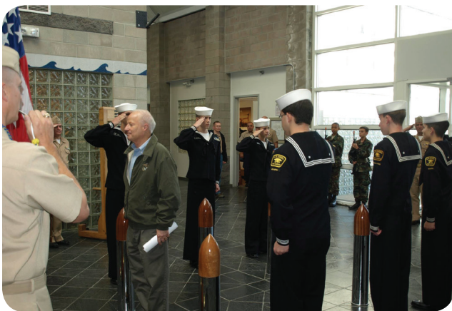
Left: Lexington Division cadets welcome Rep. Coffman with full naval ceremonies.

After officially welcoming Coffman aboard, cadets had the opportunity to engage in an insightful question and answer session. Cadets were impressed with his prior service in both the Army and the Marine Corps, and enjoyed hearing his views about the importance of the Veterans Administration. The discussion then dove into the pressing issues making news across Colorado and the world, such as immigration, foreign policy with Russia and ISIL, the impact of legalizing marijuana and the skills needed in future military personnel.