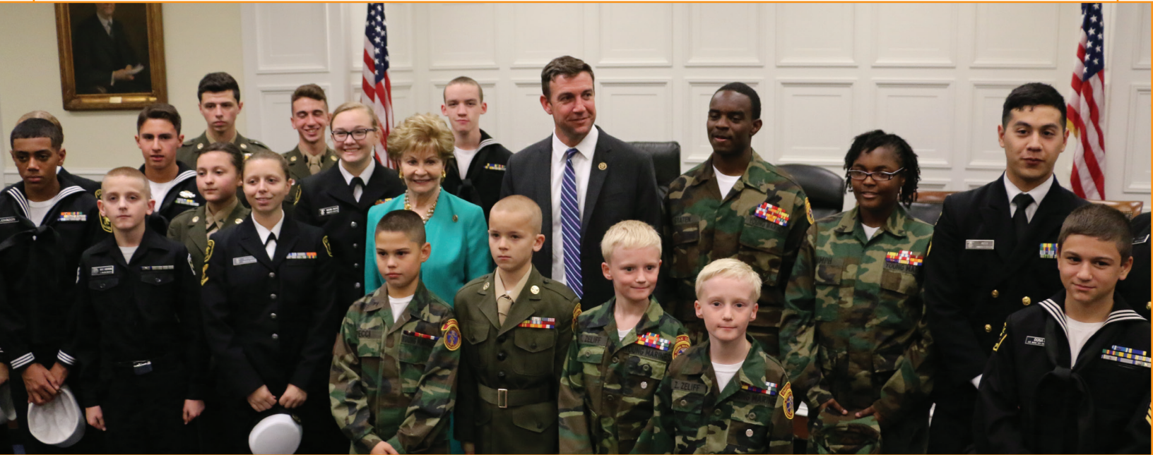
Co-chairs Reps. Bordallo and Hunter with Sea Cadets and Young Marines during the Nov. 18 event.

A big thank you to our local units who participated in the ceremony, to the offices of Reps. Hunter and Bordallo who worked hard to make this happen and to all of our supporters in Congress!