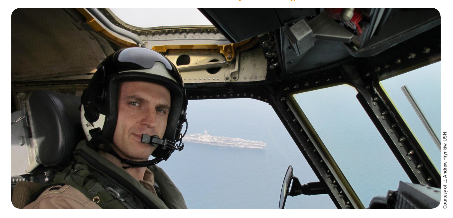
By Lt. Andrew Hrynkiw, USN

One day when I was about six years old in a small village of Ukraine, my grandmother asked me what I wanted to do when I grew up. After she asked me that question, I remembered seeing an airplane the same day and imagined myself sitting at the controls of that plane and looking at the clouds passing by. I answered right away that I wanted to be a pilot. That was not an answer my overprotective grandmother was hoping for, but that moment defined my life.