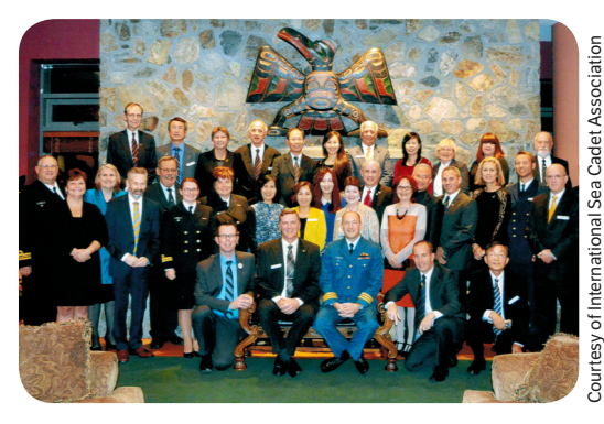
Representatives from 14 countries participated in this year's International Sea Cadet Association

As a member of the U.S. Naval Sea Cadet Corps, the International Exchange Program is available to you. Find more information at http://iep.seacadets.org and start that "Adventure of a Lifetime!"