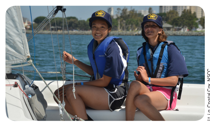
Le (left) having fun at sailing training.

we went on two- to three-hour long sails each day.